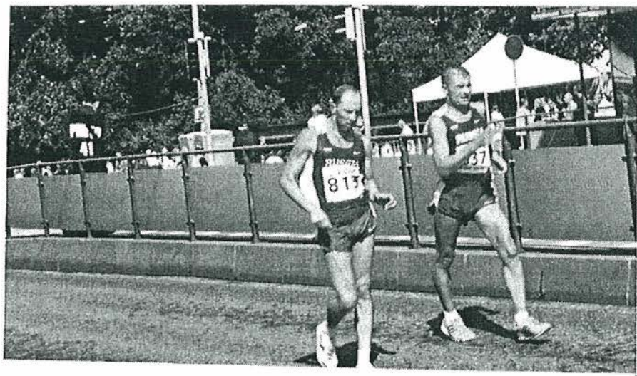
Racewalking's gold medalists at the 2005 World Championships of Track and Field held in Helsinki in August. Top: Olimpiada Ivanova, Russia, winner of the women's 20 Km. Lower left: Jefferson Perez, Ecuador, winner of the men's 20 Km. Lower right: Sergey Kirdyapkin, Russia, the 50 Km winner.